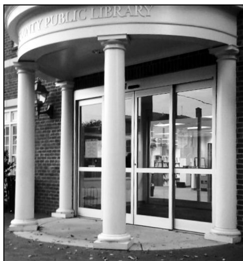
The personalized pavers highlighting the library's main entrance were the result of two successful fundraisers.

On November 5, 1981, a small band of local library supporters passed the following resolution: "That a Friends of the Orange County Library group be formed to maintain an association of persons interested in books, and libraries; to focus public attention on and to stimulate public interest in library services, facilities, and needs; to stimulate gifts of books, magazines, endowments and bequests